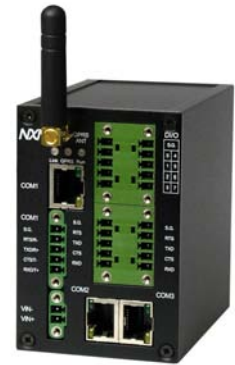
GT-431 Advanced GPRS Data Transceiver

NProbe GT-431 GPRS Data Transceiver enables various kinds of legacy devices with simple I/O and proprietary serial protocols to communicate over GSM/GPRS network and the Internet easily and freely. It not only works as a GPRS Modem, but also can cooperate with NXN's New GPRS Gateway Software to construct a smooth "GPRS Data Tunnel" between Host End and Remote End, ensuring an efficient communication for data transmission and remote device management. With 1 selectable RS-232/485 serial port, 2 RS-232 serial ports 6 Digital Inputs and 2 Digital Outputs, GT-511 is an ideal solution for factory automation, environmental monitoring and remote device management for M2M industry. Meanwhile, it is supplied with easy-to-use API and New GPRS Gateway Software that streamline application development process, freeing system integrators from dealing with complex communication protocols of GPRS and the Internet. Users do not need to change the existing system, saving cost and time for field maintenance, and making it a perfect solution for data transmission.