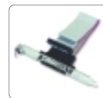
Supplied with Internal Cable for Digital I/O (IDC40 to DB37)