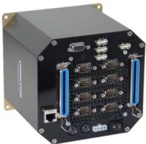
Pandora cable-free enclosure system for Helios SBC

All I/O on Helios is made available on 2mm pitch pin headers for use with low-cost cables. To enhance the use of Helios in harsh environments requiring outstanding resistance to shock and vibration, Diamond Systems offers our rugged Pandora PC/104 enclosure that provides a cable-free configuration via a small panel I/O board that installs directly on top of the Helios to instantly convert all I/O to PC-style connectors: