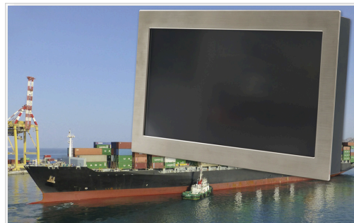
PANEL21 Solution used in Maritime Environment

All MPL products are fanless, shock and vibration proof, low power, rugged, and long-term available. The perfect solution for a system to be used in rugged environments.