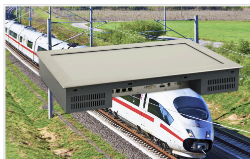
PANEL21 Solution used in Railway Application