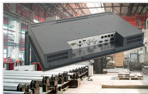
PANEL21 Solution used in Industrial Environment